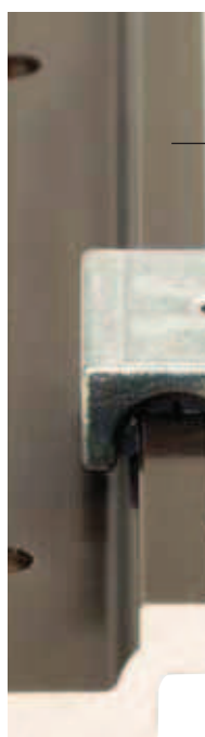
Rail Bearing block